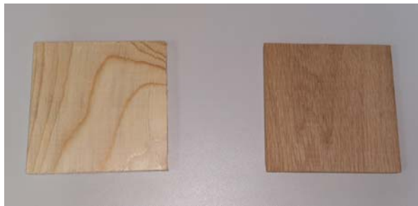
Figure 1. Fir (left) and Oak (right) board samples

Samples were conditioned in laboratory (temperature 22 \pm 2 °C and relative humidity 50 \pm 5\% ) for two