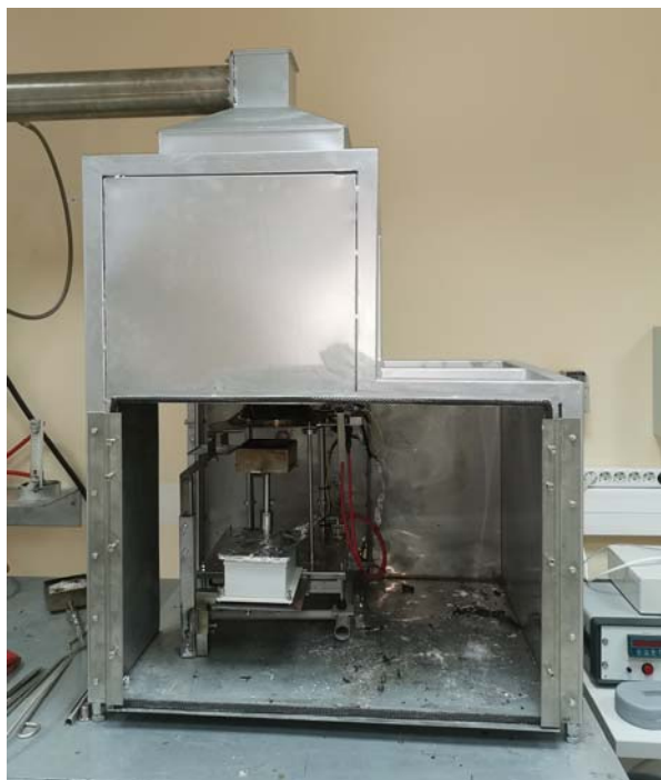
Figure 2. Mass loss calorimeter inside the specially designed fume cupboard

Experiments were performed in Mass loss calorimeter made by Fire Testing Technology - FTT (East Grinstead, UK). Mass loss calorimeter is a device used for reaction-to-fire characterization of a solid sample in a similar way as in cone calorimeter. The material testing procedure is set up in ISO 17554 [10] and EN ISO 13927 [11]. Apparatus was put in a specially designed fume cupboard in order to extract the fire effluents. Installation is shown in Figure 2.